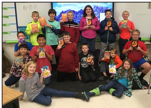
Sixth-graders with their free book from the September book orders.