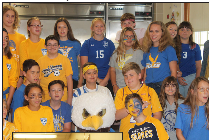
(Above) Students showed their spirit during Blue and Gold Day.

All of Alfred-Almond got into the "spirit" during Spirit Week, which culminated with the Fall Pep Rally and Bonfire Dance. Elementary and High School students had a dress-up theme each day, with Blue and Gold Day celebrated district-wide on Friday. Although the bonfire had to be postponed one day due to weather, the week garnered an enthusiastic response.