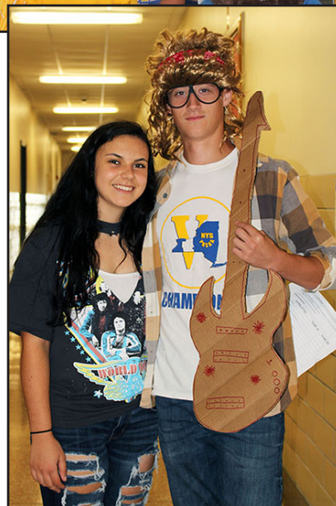
(Left) Rock and Roll Day was a big hit at the High School.