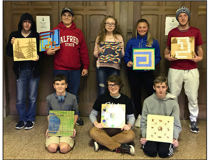
Game Design students show off their work.

Look for these new "hit" games at the Art Show in May!