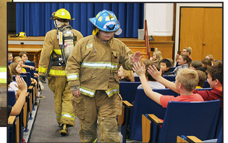
(Above) Students gave firefighters a warm welcome.