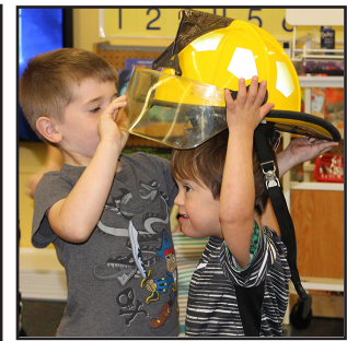
(Left) Students had fun trying on real gear.