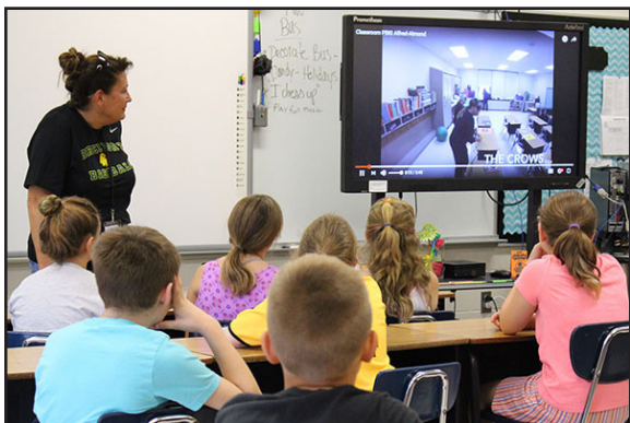
Sixth-graders watched videos that showed crows and eaglets choosing different behaviors.